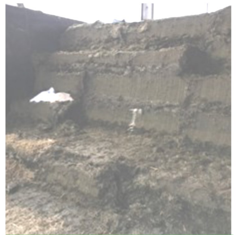
The silage is fed out using a 'stepladder' method to minimise losses. Any losses from the upper layer fall onto the lower 'step', instead of ending up on the floor and spoiling.

The silage is finally covered very carefully with plastic, pressed down particularly carefully along the edges. On top of the plastic is laid a 10-15 cm thick layer of sand. It is very important to seal along the silo walls.